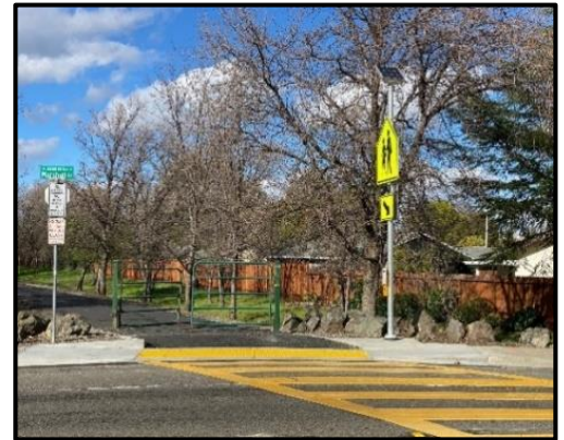
HSIP 9 crossing improvements at the Southside Bikeway crossing and Marshall Road (Vacaville)

The first project for HSIP Cycle 9 was completed by the City of Vacaville during the first quarter of FY 2020. The city installed Rectangular Rapid Flashing Beacons on Browns Valley Parkway (near Browns Valley Elementary) and at the Southside Bikeway crossing on Marshall Road. A walk audit at Padan Elementary identified that Marshall Road lacked a crosswalk for the bike path across this busy street. The new crossing serves students at Padan, Vaca Christian and Will C. Wood High Schools. Additional HSIP projects are scheduled for construction specifically around schools in Rio Vista and Suisun City later in 2021.