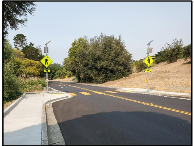
ATP-2 Project at Panorama Dr. and James Ct. near Benicia Middle School, Benicia

In addition, SR2S staff worked with the City of Fairfield and consultants on the city's ATP Cycle 5 application for the West Texas Complete Street Project and was awarded $10.8 million, including $114,000 for SR2S programming. This project brings bike and pedestrian improvements to a heavily travelled corridor and will impact students at two elementary schools and a preschool. SR2S programmatic support is slated to start at the beginning of the 2022-23 school year.