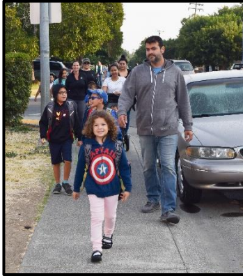
Families participate in Dixon Montessori WOW Wednesday by walking to school.