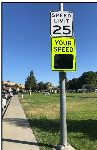
SR2S Micro Grant Project – City of Vacaville: radar feedback sign installed at Browns Valley Elementary.

Beginning in March 2021, schools began to reopen for in person classes, offering families the choice to return to campus or continued virtual learning. While schools allowed students back on campus in a limited capacity, events and activities remained suspended. Despite these challenges, SR2S staff continued to support schools, convened SR2S Community Task Force and SR2S Advisory Committee meetings, worked with schools and cities to complete SR2S Micro Grant projects, and developed new resources for the eventual full return of students to campus. Here are the SR2S Program highlights of the year.