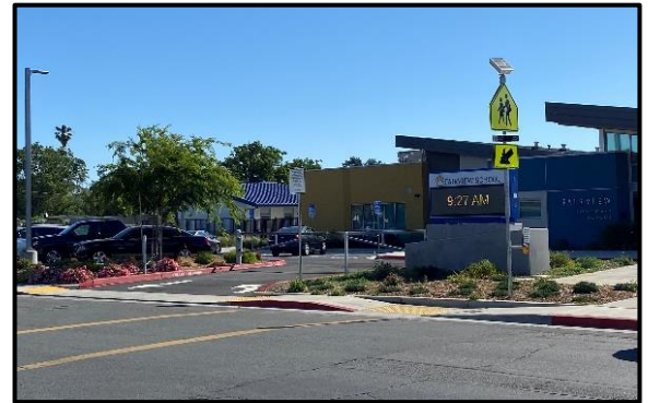
Rectangular Rapid Flashing Beacons were installed at Fairview Elementary (Fairfield). This location was identified for an improved crossing with a SR2S walk audit and discussion within the Fairfield 3Es Committee.

SR2S staff engaged with Community Task Forces (CTF) in Fairfield and Suisun City and discussed Safe Routes to School projects under construction and potential projects to include in the SR2S Plan update. Potential projects discussed include locations and improvements identified through school walk audits, the STA Countywide Active Transportation Plan (ATP), and stakeholder discussions. In May 2021, The Suisun City SR2S Community Task Force prioritized a short list of projects around schools and are working on securing funding to complete these projects in the next few years. The Fairfield 3Es (Enforcement, Education and Engineering) Committee is working on prioritizing a list of projects around schools, including projects that can be completed within regular street maintenance schedules. When schools resume in fall, SR2S staff will reconvene the CTFs in the remaining cities to prioritize their list of improvements for the upcoming SR2S Plan update. This will help STA, SR2S and the cities to readily apply for grants and funding.