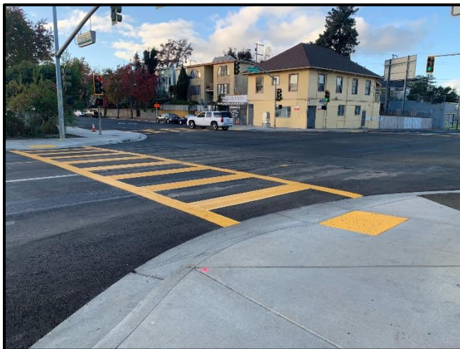
ATP-2 Project at Sonoma Blvd. and Florida St., at Lincoln Elementary, Vallejo

Since 2008, the SR2S program (working with city public works departments, schools and districts) has completed 41 pedestrian infrastructure projects across the county. In spring 2021, seven additional projects began construction as part of the Active Transportation Program (ATP) Cycle 2 award for improvements at schools in Benicia (Benicia Middle School, Joe Henderson, Mary Farmer, Robert Semple and St. Dominic School), and at Cooper and Lincoln Elementary schools in Vallejo. These improvements include high visibility crosswalks, pedestrian activated beacons, school crossing signage, and sidewalk installation or widening.