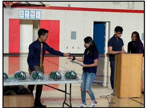
Virtual Bike Lesson participants received bike safety equipment at Crystal Middle School in Suisun City.

Crystal Middle School's Beyond Differences Student Service Organization (BDSSO) and the Suisun City Youth Commission (SCYC) hosted virtual bike-related lessons leading up to Bike Month in May. Students from the SCYC and BDSSO collaborated with SR2S staff in planning the afterschool event. Via Zoom, the Bay Area Bike Mobile taught four interactive lessons: "Proper Bike Fit and Types of Bikes," "How to Lock Your Bike to Keep it Safe," "ABC – Quick Check Pre-ride Inspection," and "How to Fix a Flat Tire". Twenty-two students from seven elementary, middle and high schools in the Fairfield-Suisun Unified School District participated in the virtual lessons – the only ones offered in Solano County. On June 17, 2021, SR2S staff attended a recognition event at Crystal Middle School (Suisun City), where students that participated in the virtual lessons received bike helmets, bike lights and bells.