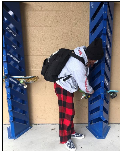
SR2S Micro Grant Project – Vaca Pena Middle School (Vacaville): purchase and installation of locking skateboard racks.