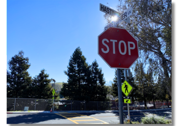
Installed RRFB. Funding awarded to Joe Henderson Elementary School (Benicia) from Cycle 1.

Projects to be constructed in the public Right of Way must be accompanied by a Letter of Support from the corresponding city/county Public Works Department. The city/county may also help identify project timeline and cost.