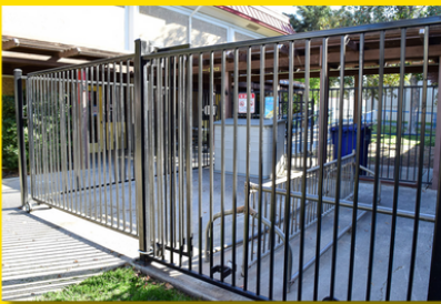
Secure bike storage installed with funding from Cycle 1 at Riverview Middle School (Rio Vista).

Ineligible expenses: Bicycles for individuals, food/refreshments, salaries, camera and other photography equipment, gift cards, stipends