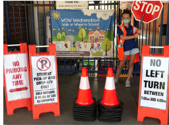
Dixon Montessori Charter School purchased safety equipment with funding awarded from Cycle 1.

Ineligible expenses: Bicycles for individuals, food/refreshments, salaries, camera and other photography equipment, gift cards, stipends