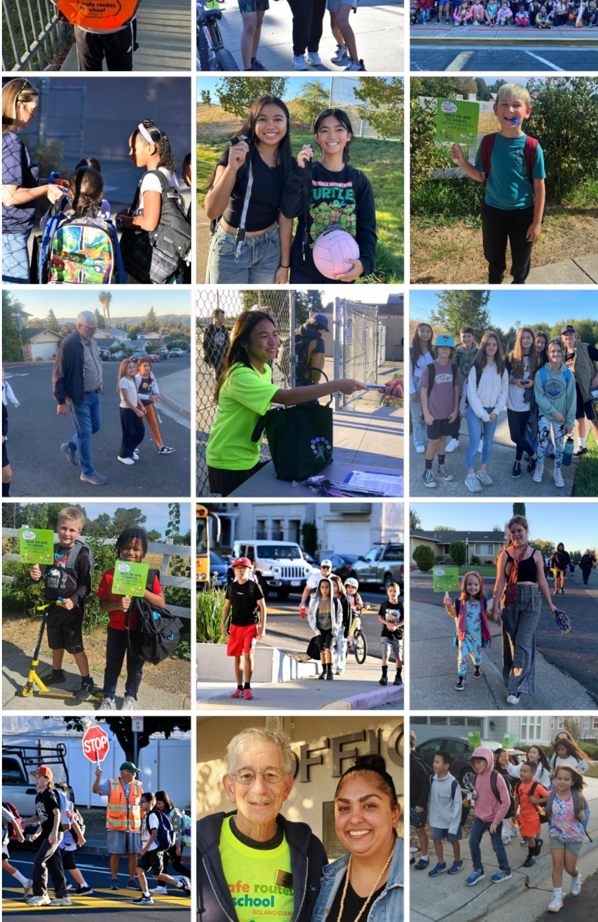
Solano Transportation Authority's 27th Annual Awards - SR2S Category Winner November 13, 2024