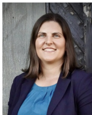
Andrea Sorce Mayor, City of Vallejo