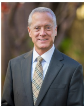
John Carli Mayor, City of Vacaville