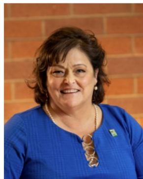
Catherine Moy Mayor, City of Fairfield